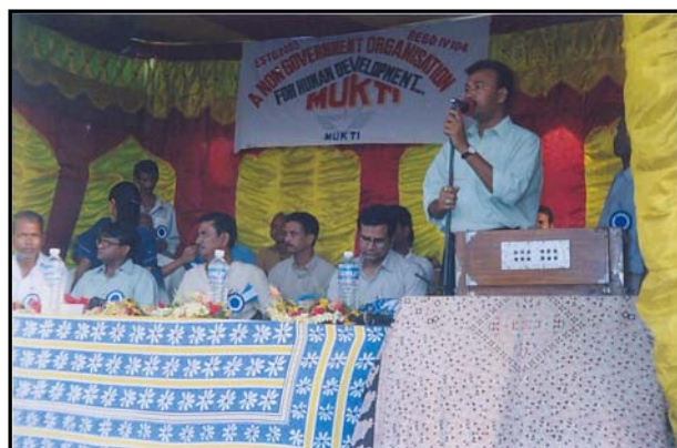
Mukti representative addressing the assembly