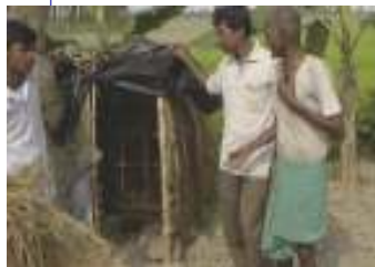
A typical latrine which Mukti has built in the region.

International Health Organization has multifarious planning programs. Stretching helping hands, our organization is waiting in faith for sincere co operation. In monsoon, reptile-snakes, the small poisonous creatures of nature badly affect the rural areas in a large extent. Life of the people becomes miserable. No arrangements for proper treatment, only superstition prevails; people have to accept death.