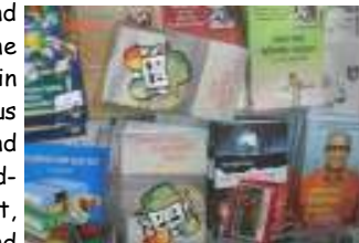
Mukti Book Bank Project

The primary aspect to build a nation is education. On the basis of the 53 rd report of NSSC (National Survey committee), the literacy rate of West Bengal is only 72%. Lack of proper education system, scarcity of good schools, economic condition and shortage of proper guidance are the main cause of the poor literacy rate in villages. Mukti has implemented various programs for the development and facilitation of education, such as 'mid-day meal', 'coaching center' project, 'Talented Student Sponsorship' and 'book bank' project to overcome this most challenging issue.